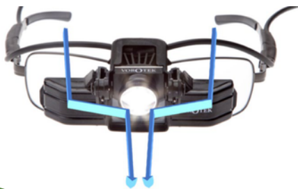
Figure 1. 12mm Converged Binocular Optical pathway.

The Integrated Converged Binoculars can easily be rotated in and out of use. Upward rotation of the Converged Binoculars allows uninterrupted vision, with or without headlight illumination.